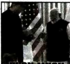
ELON MUSK Tesla and SpaceX CEO Giving spaceship armor to Modi