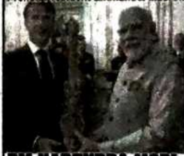
PM NARENDRA MODI

Gifting a unique sandalwood sitar to French President Emmanuel Macron