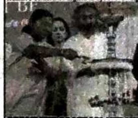
PRESIDENT DRAUPADI MURMU

Lighting the inaugural lamp of the International Women's Conference organised by Art of Living